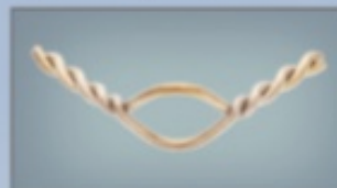
Clip marker Eye shape