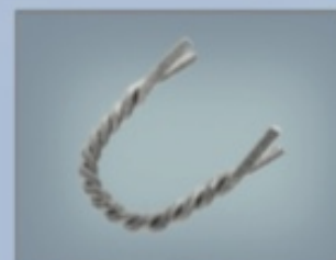
Clip marker U-shape