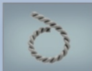
Clip marker Q-shape

The Tumark® Family of Tissue Markers enables precise tissue marking with an easy to use delivery system designed for one hand operation. The Tumark's proprietary clip design has four 'feet' to facilitate precise anchoring into tissue which assures the physician that the clip will remain in the exact and desired position upon deployment. Preloaded with a state of the art, highly echogenic, 3-Dimensional marker will provide sufficient radiographical and radiological visibility under any imaging modality, the Tumark® products are specifically designed to address the many pitfalls associated with "clip migration".