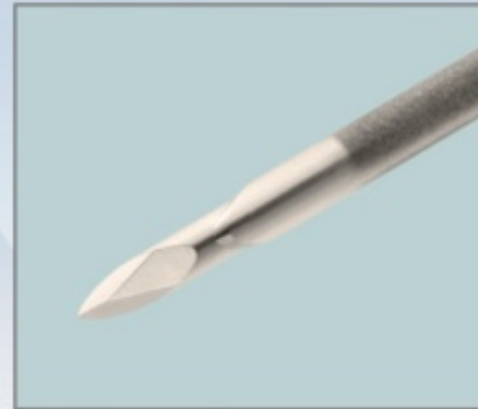
Atraumatic needle tip and echogenic marking for precise Ultrasound positioning