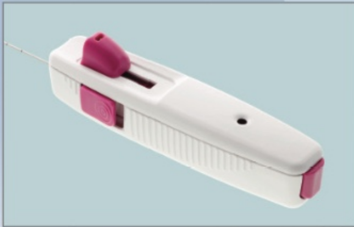
Two trigger buttons: one on the side and one on the rear